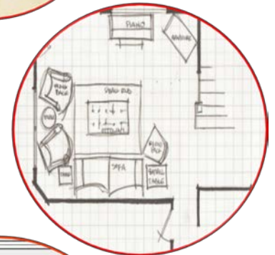
Your Sketch & Measurements